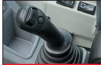
Hydraulic Joystick Controls