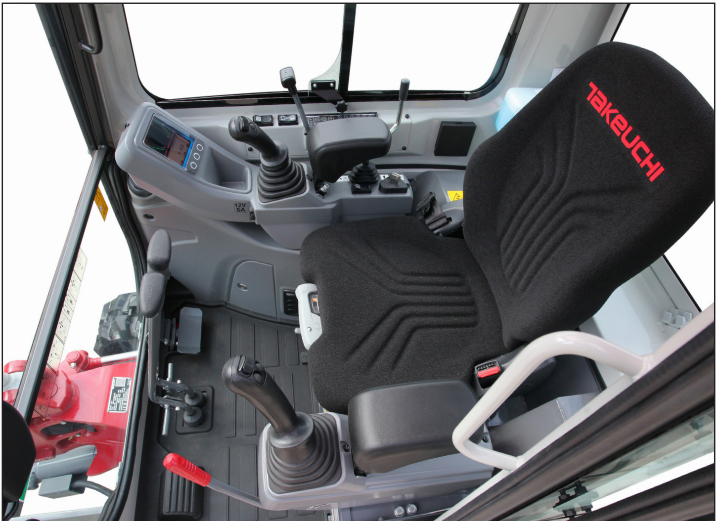
Spacious Automotive Styled Interior with Intuitive Operator Controls

The TB320 is a conventional tail swing excavator making it a very stable platform that provides excellent lift capacity. It is also available with up to four auxiliary circuits making it easy to add hydraulically driven attachments. The primary auxiliary circuit features best in class auxiliary flow of up to 40 L/min and it is controlled using a proportional slider switch located on the left joystick allowing the operator to meter flow to the attachment.