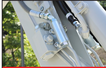
Multiple Service Ports (Up to 4)