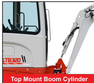
Top Mount Boom Cylinder