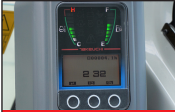
3.5" Color Display