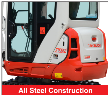
All Steel Construction