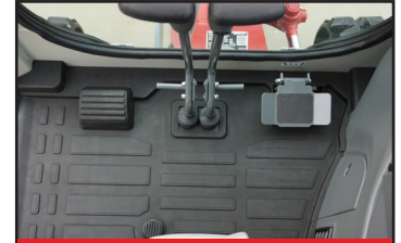
Large Floor with Foot Rest

Designed to work in confined and demanding applications, the Takeuchi TB320 features many advancements in performance and technology that make it an extremely versatile and productive machine. It is easy to transport and well suited for working in a wide range of applications from urban construction sites to areas with limited access such as around businesses, apartments, and homes. A key feature of the TB320 is the hydraulically controlled, variable width undercarriage that can retract to 980 mm and expand to 1370 mm wide. With the undercarriage fully retracted, the machine is able to maneuver easily through narrow passages to get to the work site. Once on-site, the undercarriage can be expanded to provide optimum balance and stabilization.